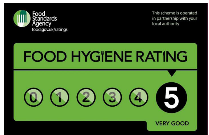
Figure 1: Example of a FHRS with a score of 5