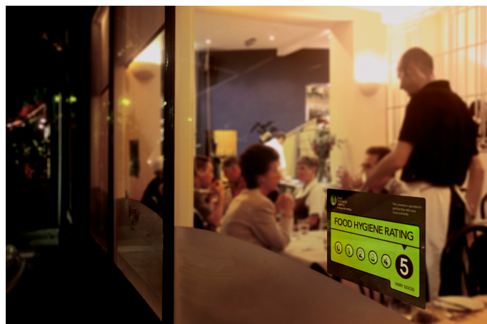
Figure 2: Example of a FHRs sticker with a score of 5 in a window of a food premises

Currently allergen management is not included in the scheme, but this may be incorporated into the FHRs audit, in the future.