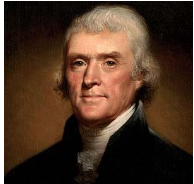
Thomas Jefferson 1789

“Whenever the people are well informed, they can be trusted with their own government; that whenever things get so far wrong as to attract their notice, they may be relied on to set them to rights.”