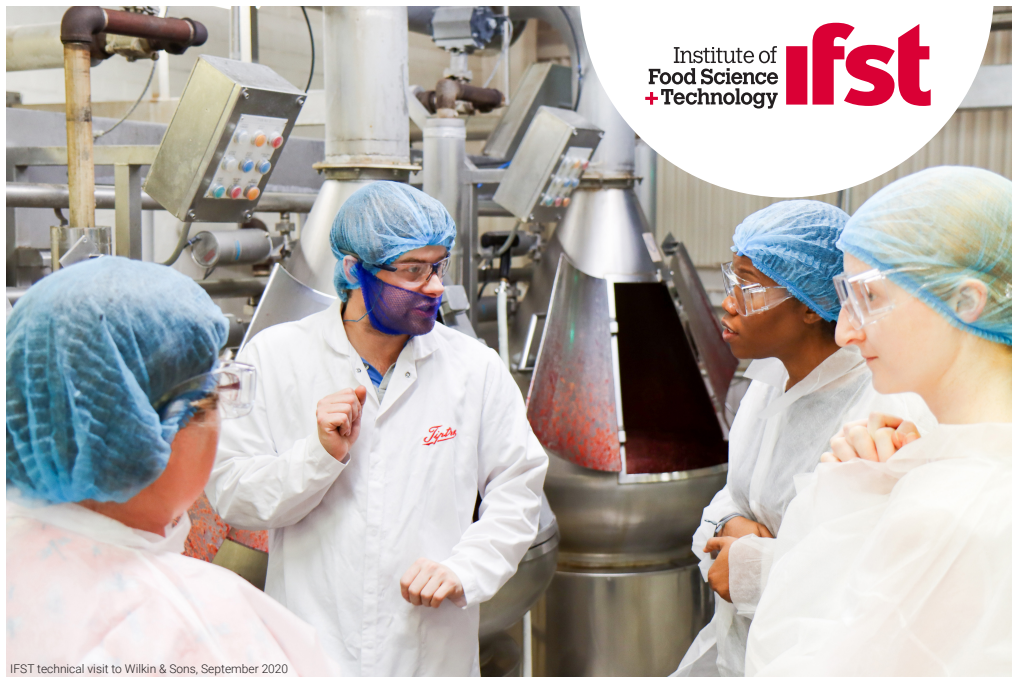
IFST technical visit to Wilkin & Sons, September 2020

Institute of Food Science + Technology ifst